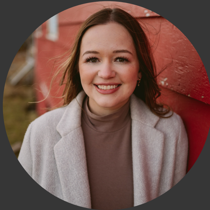
Karen Perry Hatch Ltd.